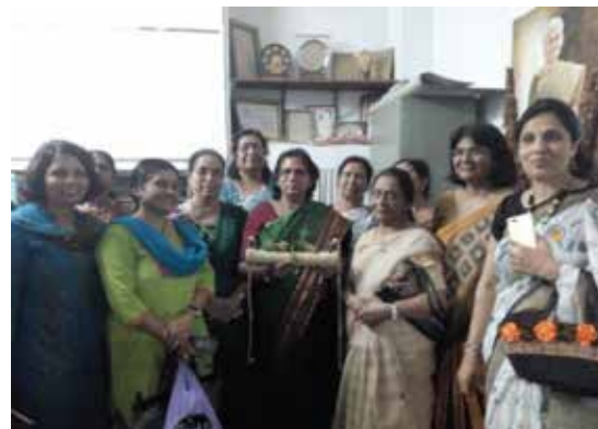
International Women's Day, Nagpur Branch, 7 th April, 2018