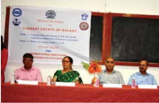
National Workshop on "Current Facets of Botany", Baroda Branch, 24 th -30 th July, 2017