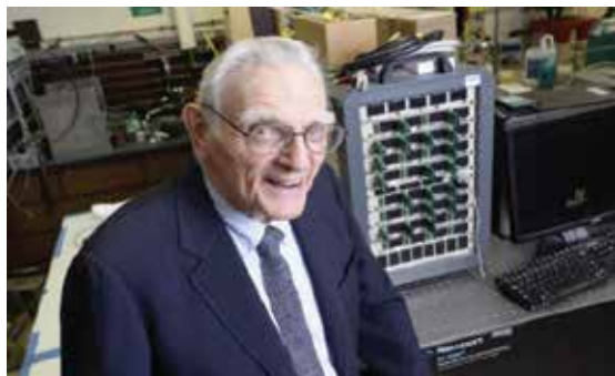
Dr. John B. Goodenough

(Abridged from https://news.utexas.edu , February, 28, 2017)