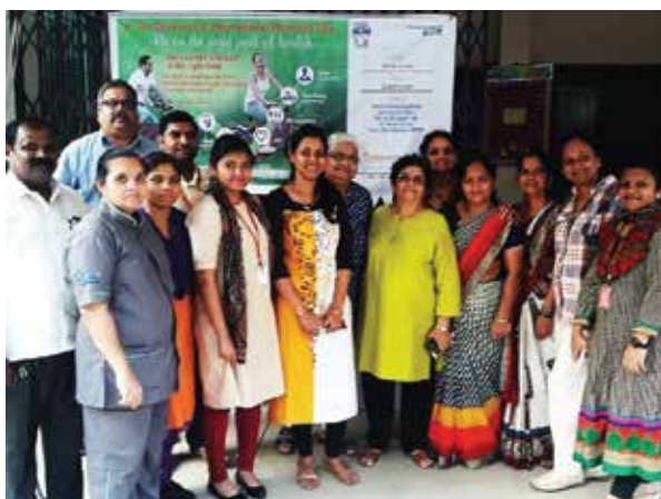
Free Medical Camp at IWSA on the occasion of International Women's Day, at IWSA, 10 th March, 2018