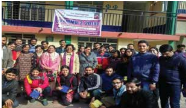
VAMMO-2018 Participants, Roorkee Branch, 28 th January, 2018