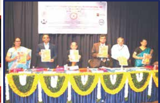
National Seminar on "Impact of Climate Change on Biodiversity – III" Baroda Branch, 29 th November, 2017