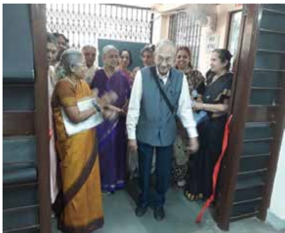
Inauguration of Science Exhibition at IWSA, 3 rd February, 2018