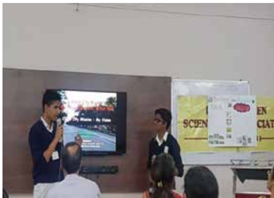
Presentation by School Students on Children's Day, Nagpur Branch, 30 th November, 2017