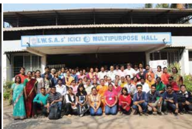
Science Academies' Laser Workshop, 20 th -21 st January, 2018