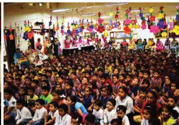
"Rainbow 2018", 22 nd -23 rd February, 2018