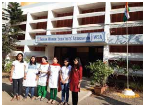
Republic Day Celebration by Hostel Girls at IWSA, 26 th January, 2018