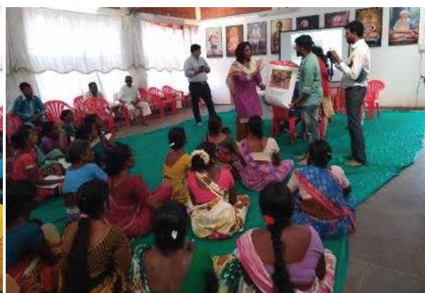
Cancer Detection Camp at Kawthewadi, Raigad District, Maharashtra, 15 th January, 2018