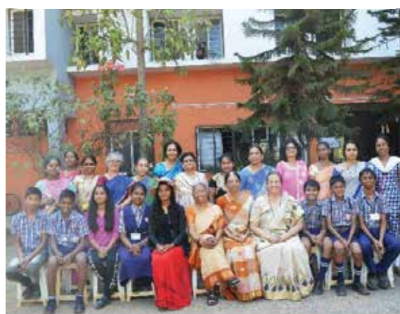
Closing Ceremony of Science Nurture Program at IWSA, 20 th March, 2018