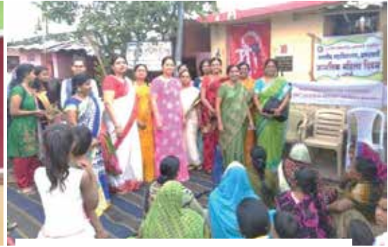
International Women's Day Amravati Branch, 8 th March, 2018