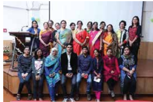
VAMMO-2018 Prize Winners Roorkee Branch, 24 th February, 2018