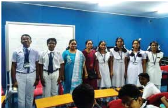
Winners of the Science Day Event, Kalpakkam Branch, 24 th February, 2018