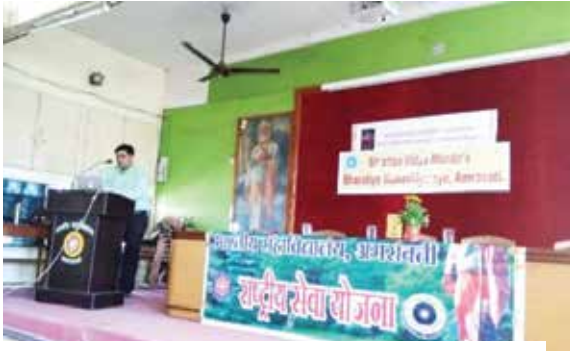
Hepatitis B Awareness Program Amravati Branch, 8 th February, 2018