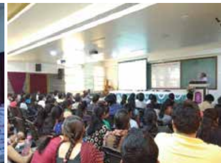
Pune Branch Activities: Left: Science popularization Lectures 5 th March, 2018 Right: Women's Day Program 8 th March, 2018