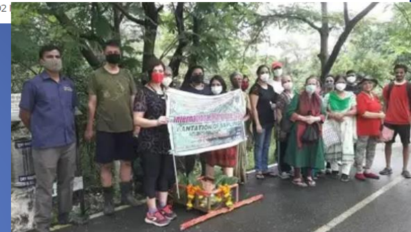
The event was conducted with much fanfare and the saplings were transported in a palki decorated with flowers to the plantation spot.

https://timesofindia.indiatimes.com/city/navi-mumbai/navi-mumbai-women-scientists-citizens-plant-mangrove-saplings-at-vashi/articleshow/84765102.cms